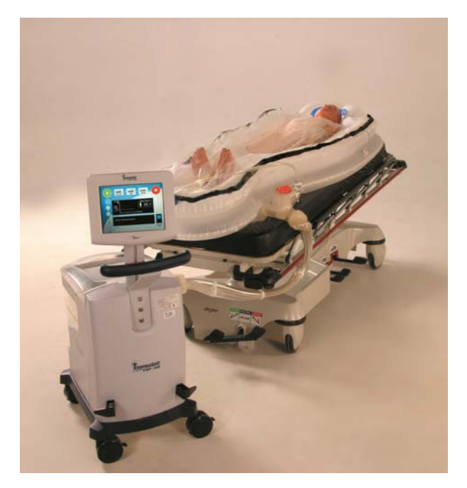
The LRS ThermoSuit • System : Provides the highest noninvasive patient cooling power available.

decreases the risks and consequences of short-term side effects, such as shivering and metabolic disorders" [12].